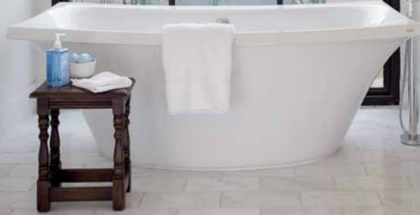
STYLING: AMY BURKE

Painted black, the window frame extends the eye outward to the courtyard.